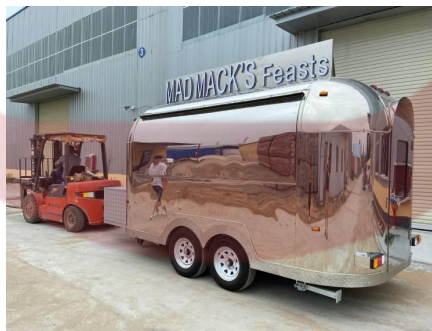
- Towing -