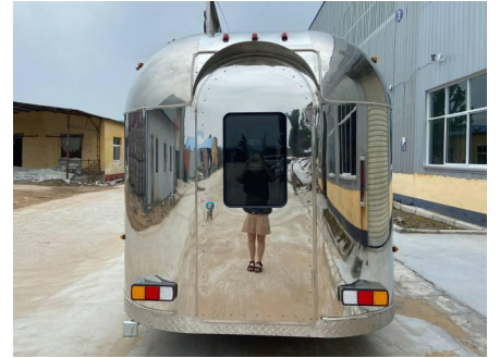
- Door -