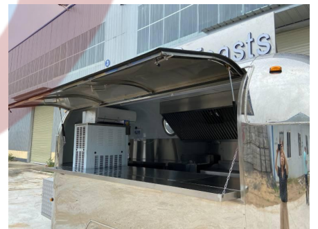
- Concession Window -