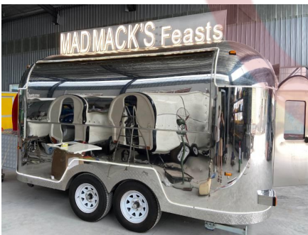
- Lights -