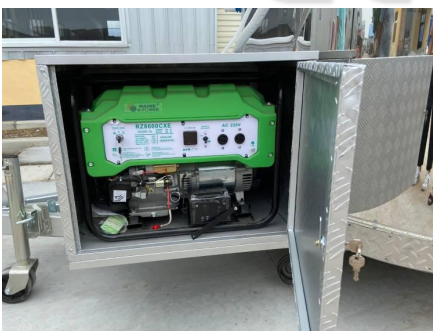
- Generator -