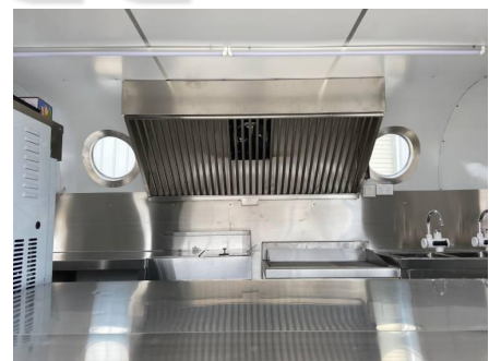
- Kitchen Equipment -